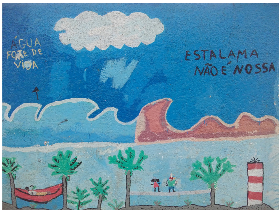
Figure 3 – Children's painting in school of Regência Augusta. Sept. 2017

The negotiations being made to secure an agreement between the two Brazilian states (MG and ES), the companies responsible for the Fundão dam and the governmental agencies responsible for environmental and indigenous protection were neither transparent nor democratic. Neither did these discussions admit questions about the viability of mining as such nor query the politics or beneficiaries of the technocratic language of “risk”. They resulted in an agreement, signed on 2 March 2016, that created the Renova Foundation, meant to implement socioenvironmental and socioeconomic programs to deal with the consequences of the dam disruption 56 . Renova has as founders Samarco Mineração S.A., Vale S.A. and BHP Billiton Brazil Ltda., the very companies responsible for the disaster (its community advisory board, meanwhile, does not have the power of imperative decisions 57 ). In Portuguese, the name Renova means “Renew our Renewal”—but activists have taken to calling the organization rather “The Crime that Renews Itself”—an association bolstered by their reading of the organization’s logo, a closed circle that loops together companies and leaves out citizens, activists, and environments.