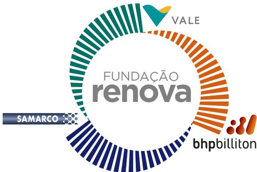
Figure 4 – A repurposing of the Renova Foundation logo. Found on Facebook, Oct. 2016.

The circularity of this design evokes the recurring wave, but also the continued, looped presence of toxins, scattered to the sea every time it rains, and/or when the waters of the ocean become turbulent and the mining tailings are brought to the surface; the mining tailings have now been made part of the hydrosocial cycle 58 .