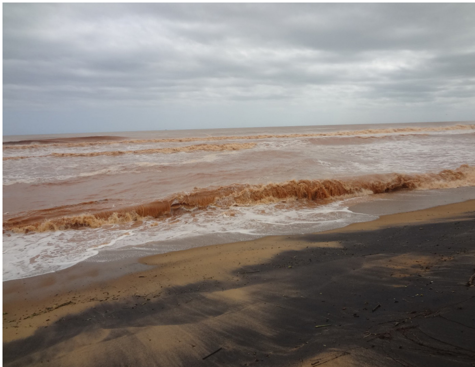
Figure 2 – Comboios beach with mining tailings in seawater Regência Augusta. Nov. 2016 54