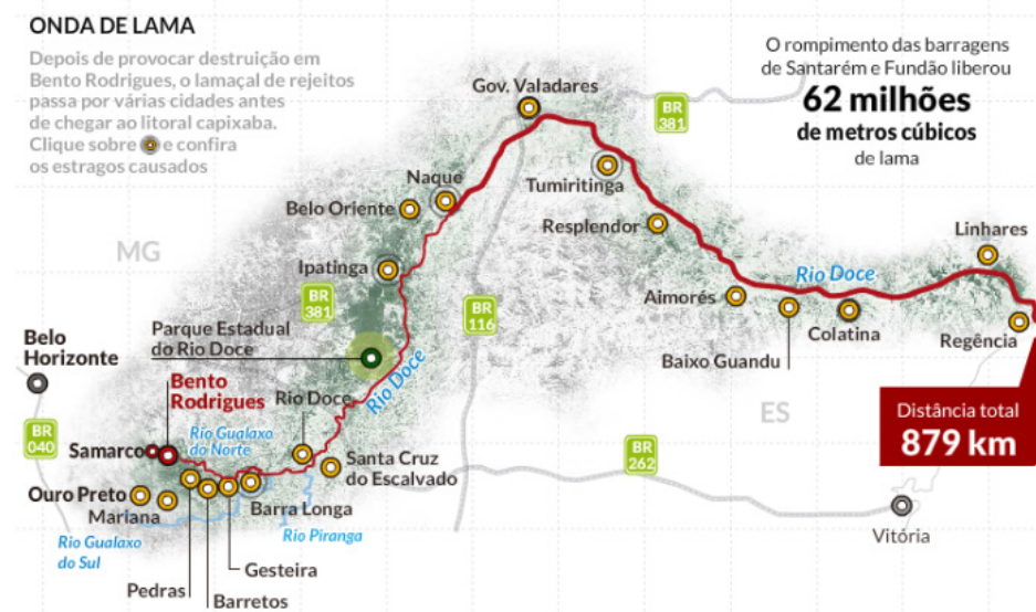
Figure 1 – Map of the wave of mud.

In this article, we analyze the figure of the wave of mud . We pay attention to representations of the wave in the news, to a theatre production about the wave and its aftermath, and to a documentary film based on eye- and earwitness testimonials at the wave's origin point of Bento Rodrigues. We also follow narratives downstream, listening to political and legal discussions and drawing from sociological research conducted by a team from the Universidade Federal do Espírito Santo (UFES). We depend, too, upon ethnographic work one of us' conducted in an affected community at the Brazilian coast, in the state of Espírito Santo (ES), at Regência Augusta, a site of domestic nature tourism 8 , a marine conservation project, and surf recreation 9 . We attend along the way to the materiality of the wave, including its load of lead, arsenic, and mercury.