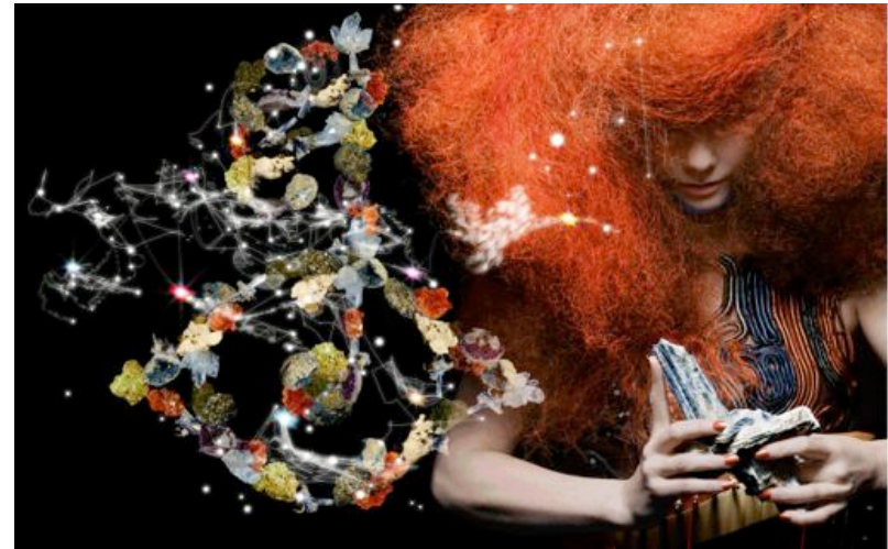
Cover art from Björk’s Biophilia , Polydor Records, 2011.

Like a virus needs a body, as soft tissue feeds on blood, some day I’ll find you — one day I’m there. Like a mushroom on a tree trunk, as the protein transmutes, I knock on your skin—and I am in. 9