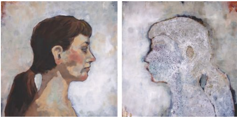
"Our Self Portrait: the Human Microbiome," Joana Ricou, 2011. Oil on canvas, two panels 16 x 16 in. Image courtesy Joana Ricou.

How do biologists imagine the human being these days? The Human Microbiome Project, inaugurated in 2008 and sponsored by the United States National Institutes of Health, tells us that human bodies are mostly microbial—mostly made up of microbial ecologies: "Within the body of a healthy adult, microbial cells are estimated to outnumber human cells ten to one." 1 What does this mean?