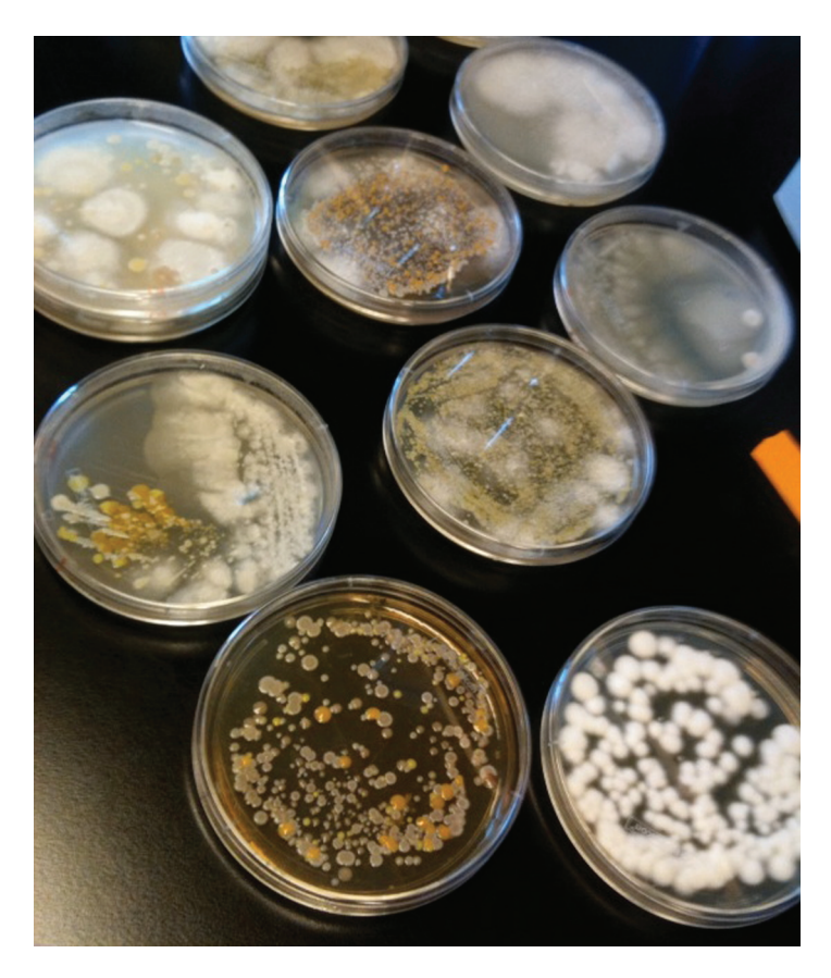
Figure I. Bacterial cultures sampled from artisanal cheeses, from Dutton's lab.

rind is, and how it got that way, at the microscopic level; they had little interest in (say) improving its shelf life or market stability.