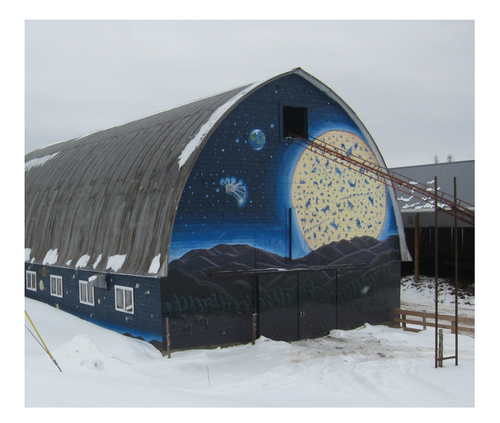
Figure 3. A mural, painted by Tara Goreau, on the barn of Jasper Hill Farm.

It depicts a 'Bayley Hazen Blue Cheese Moon rising over the hills, while the Earth and a spaceship (in the form of the Jasper Hill Cellars) hover in the distance – suggesting that we might not actually be on the Earth here in Vermont', writes Goreau. (Sutkoski, 2012)