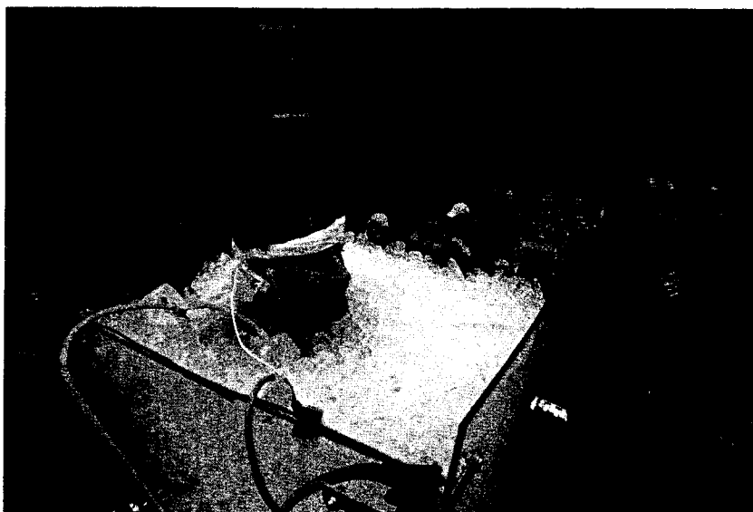
FIGURE 2. Wim Hoff, in a version of Tibetan tumo meditation, displays his ability to withstand extreme cold and, indeed, generate body heat. He is shown here standing in ice (ambient temperature was below freezing) for over one and one half hours in front of the Rubin Museum of Art in New York City. Our observations merely tell us that though the photograph reveals extreme control – withstanding freezing temperatures for, at this event, approximately an hour and a half with no clothing or insulation – Mr. Hoff’s facial expression is fairly calm, although intent.

but, again, we cannot ascertain an adept’s inner state. Our observations merely tell us that though the photograph reveals extreme control – withstanding freezing temperatures for, at this event, approximately an hour and a half with no clothing or insulation – but with a fairly calm, although intent, facial expression. Although it is difficult to imagine a neuroscanning technology employable in such situations, perhaps one will be available in the future; we still would not know what the person is thinking.